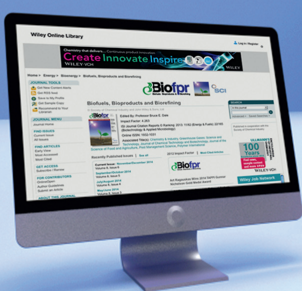
Wiley Online Library